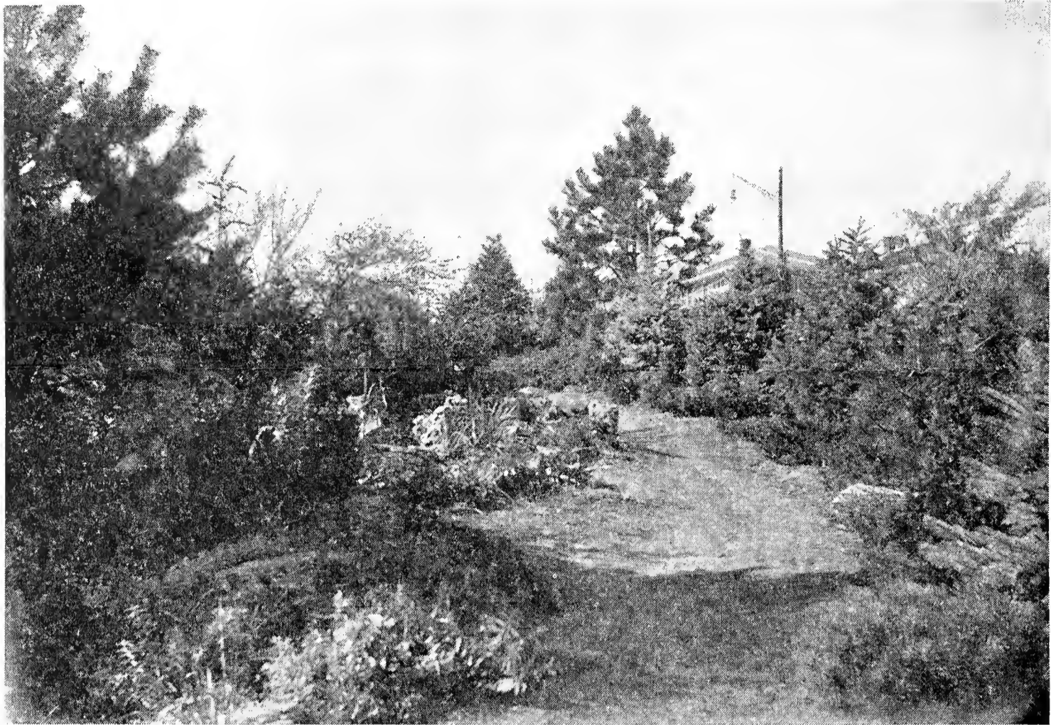
One of many views at the Nursery